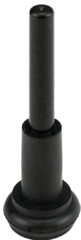
Standard "stubby" antenna

The Prism Register is compatible with several types of antenna for various applications. Extension cables are also available.