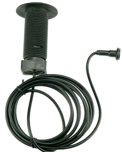
Pit-cover mounted antenna