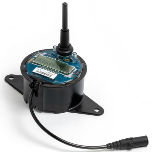
METRON Prism R

The Prism R cellular monitor is a sophisticated register which records water consumption data every 5 minutes, uploading that data nightly via the cellular network in your area. Taking its flow signal from a standard 3-wire connection, it is compatible with the Universal Duplexer.